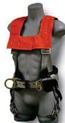
400SC-FR (harness not included)