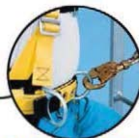
850B-TS Front D-ring (Connected)