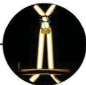
552 (Back) Shows reflective material in dark