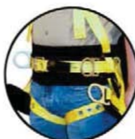
8D150ABT with Derrick Belt Removed